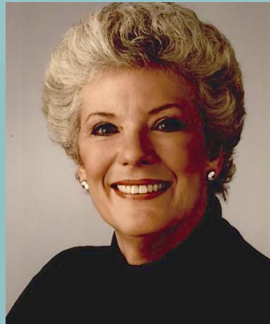
Hon. Carole K. Bellows Circuit Court of Cook County